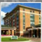
ROBERT A.M. STERN