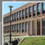
HARRY WEESE FAIRBANKS MALL