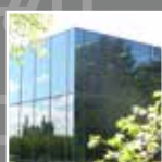
HARDY HOLZMAN PFEIFFER